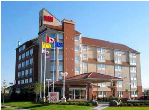
Monte Carlo Inn