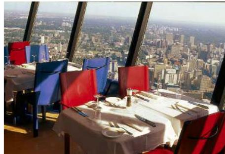
360 Revolving Restaurant

301 Front Street West Toronto, ON Tel 416.362.5411 www.cntower.ca