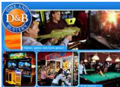
Dave&Buster's Toronto, ON

Break out of your daily routine and have some FUN in a 65,000 sq. ft midway! Built as a playground for adults including amazing food, fully stocked bars, midway, arcade, billiards, skeeball and much more.