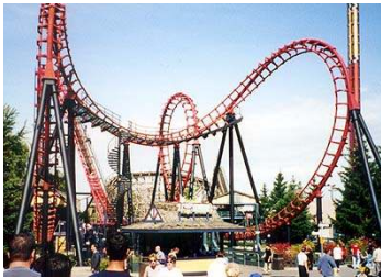
Vortex - roller coaster

Canada's premier theme park. Features 200 attractions, 65 rides, North America's greatest variety of roller coasters and a 20 acre water park called Splash Works.