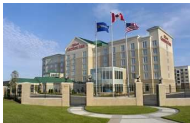
Hilton Garden Inn