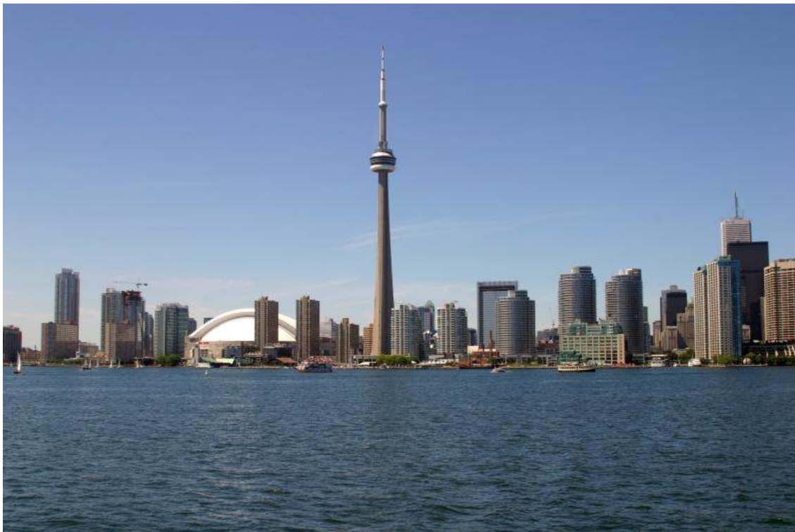
Toronto's Skyline – featuring CN Tower and Skydome

Dalton Pharma Services provides contract research and manufacturing services to help companies accelerate their drug discovery and development programs.