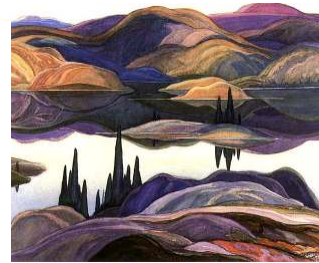
"Mirror Lake" by F. Carmichael

The McMichael Canadian Art Collection, nestled in 100 acres of stunning woodland is renowned for showcasing 20th-century 100 % Canadian art including artwork from The Group of Seven.