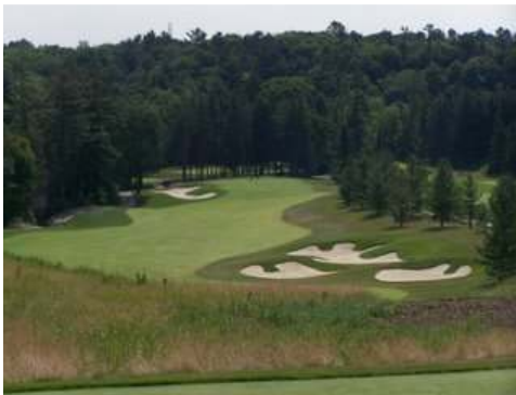
Copper Creek #4