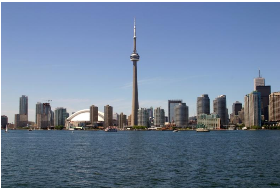
Toronto's Skyline – featuring CN Tower and Rogers Center

Dalton Pharma Services is a leading cGMP contract service provider of integrated drug discovery, development and manufacturing services to the pharmaceutical and biotechnology industries. We are FDA registered and Health Canada approved, and bring over 30 years of experience to every project. We deliver fully integrated solutions with an emphasis on speed, flexibility and quality. We are experts in Custom Synthesis , cGMP API Manufacturing , Formulation Development , API Process Development , Sterile Filling Services and Accelerated Stability Testing .