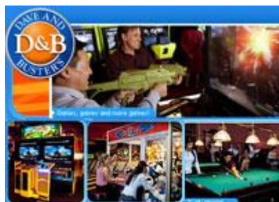
Dave & Buster's

Break out of your daily routine and have some FUN in a 65,000 sq. ft midway! Built as a playground for adults including amazing food, fully stocked bars, midway, arcade, billiards, skeeball and much more.