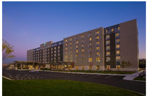
Homewood Suites Vaughan