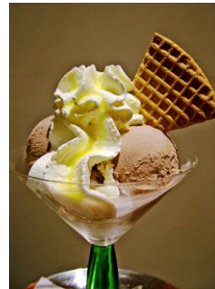
Jump Café & Bar

18 Wellington Street West Commerce Court East Toronto, ON Tel 416.363.3400 www.oliverbonacini.com