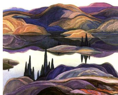
"Mirror Lake" by F. Carmichael

The McMichael Canadian Art Collection, nestled in 100 acres of stunning woodland is renowned for showcasing 20th-century 100% Canadian art including artwork from The Group of Seven.