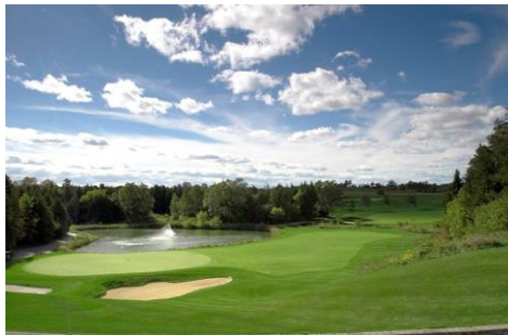
Angus Glen Golf Club

Top 18 Holes in the GTA & Best Pro Shop in GTA - Gold in Golfer's Choice Award (2013)