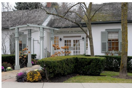
Auberge du Pommier

4150 Yonge Street Thornhill, ON Tel 416.222.2220 www.oliverbonacini.com