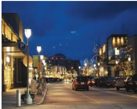
Shops at Don Mills

1090 Don Mills Road Don Mills Road and Lawrence Avenue East (2 blocks west of Don Valley Parkway) Tel 416.447.6087 www.shopsatdonmills.ca