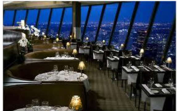
360 Revolving Restaurant

301 Front Street West Toronto, ON Tel 416.362.5411 www.cntower.ca