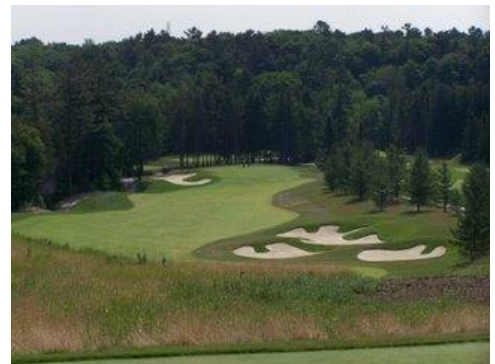
Copper Creek #4

Voted Best Public Golf Course in the GTA (2013)