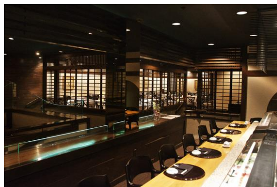
Katsura Japanese Restaurant

900 York Mills Road (At the Westin Prince Hotel) Toronto, ON Tel 416-444-2511 www.katsurarestaurant.com