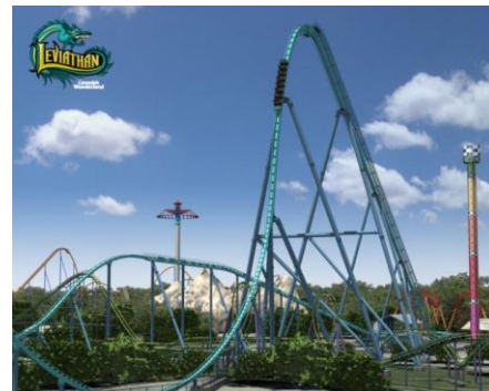
Leviathan - roller coaster

Canada's premier theme park. Features over 200 attractions, 69 thrilling rides, North America's greatest variety of roller coasters and a 20 acre water park called Splash Works.