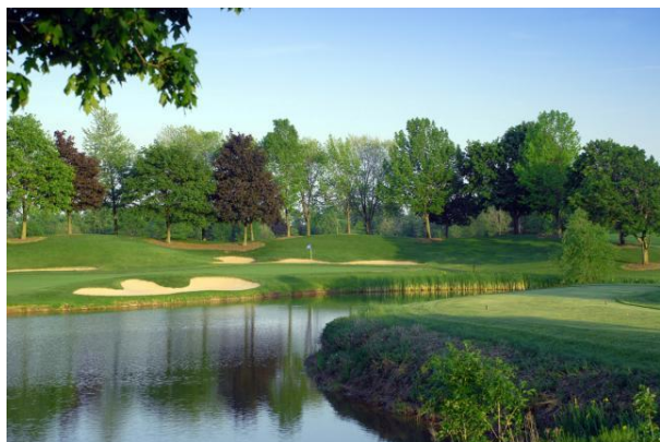
Glen Abbey Golf Club #3